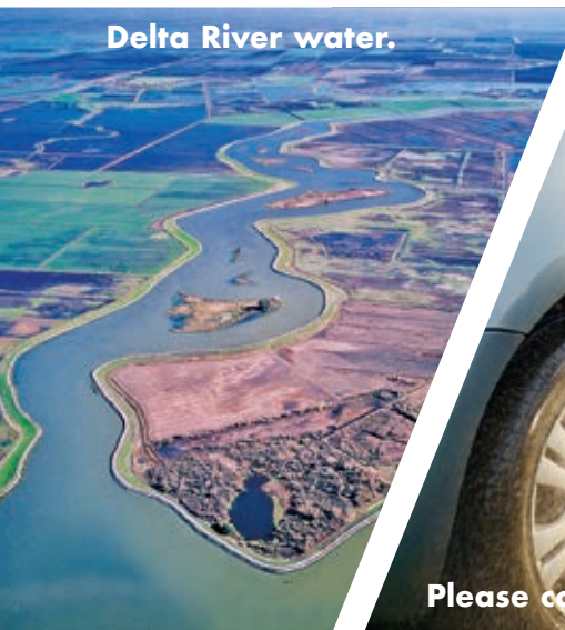
Delta River water.