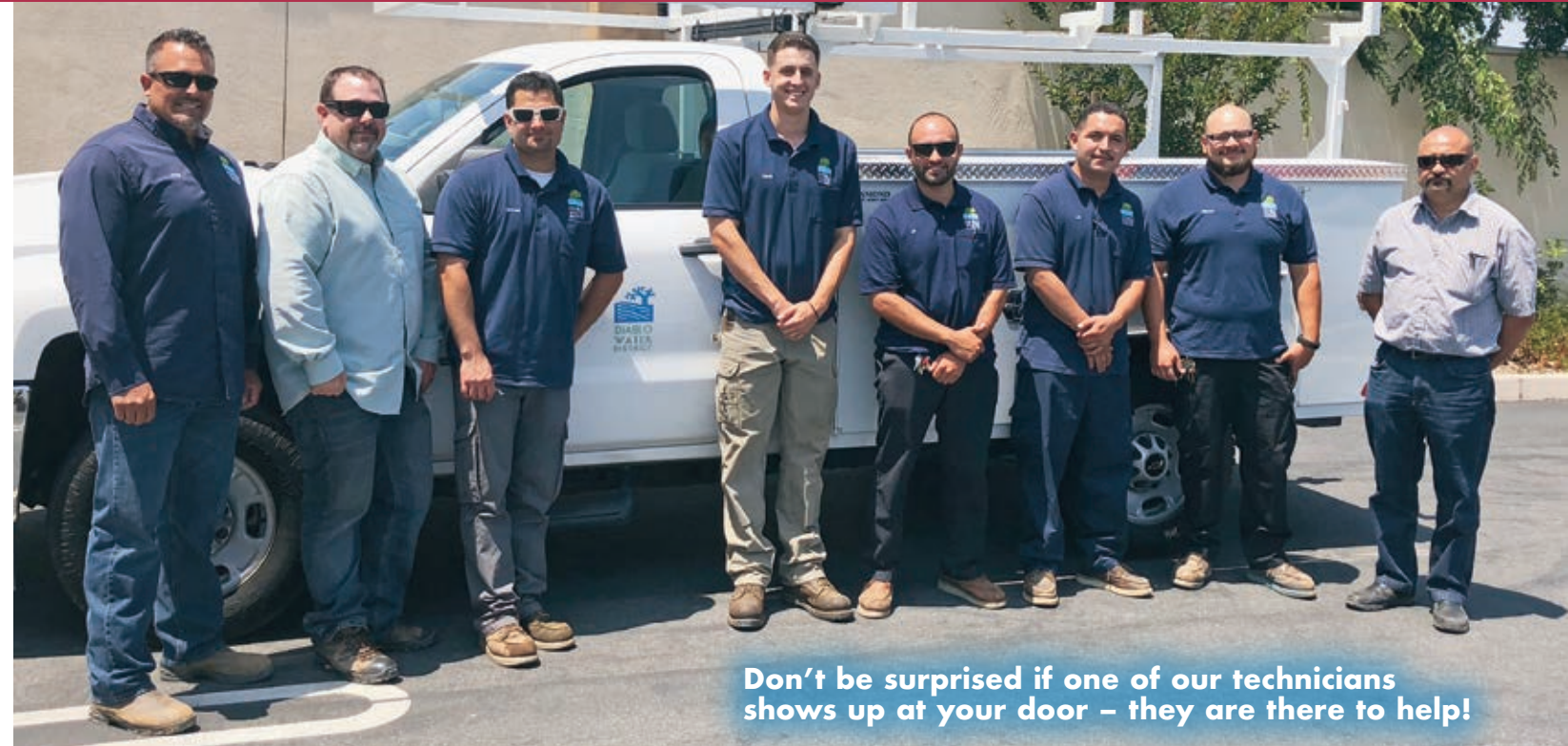
Don't be surprised if one of our technicians shows up at your door – they are there to help!